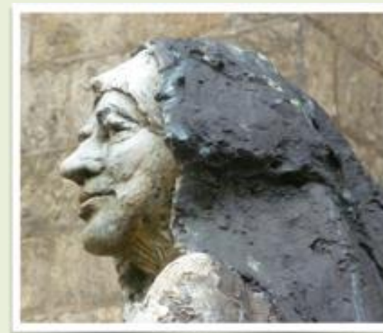
Sculpture of Mary Ward in Mainz, Germany

Be convinced that God will always give you what is best for you. Mary Ward