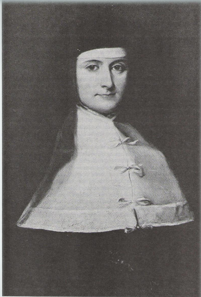
Teresa Ball 1794-1860

From the collection of the Institute of Health and Human Studies, University of London, 1971